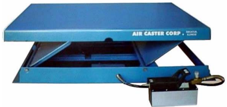
Fully adjustable from 4½" to 14½" high

The need for adjustable height work platforms can occur wherever operator working height changes due to changes in machine or tooling height. Model or product changes can result in changes in working height. The need can also occur where the working height is fixed, but the physical height of the operators varies.