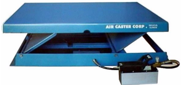
Fully adjustable from 4½" to 14½" high

The need for adjustable height work platforms can occur wherever operator working height changes due to changes in machine or tooling height. Model or product changes can result in changes in working height. The need can also occur where the working height is fixed, but the physical height of the operators varies.